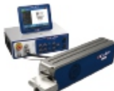
Laser Coding System