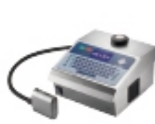
Large Character Ink-jet Printer