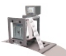
Thermal Transfer Printer