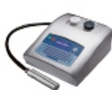
Continuous Ink-jet Printer